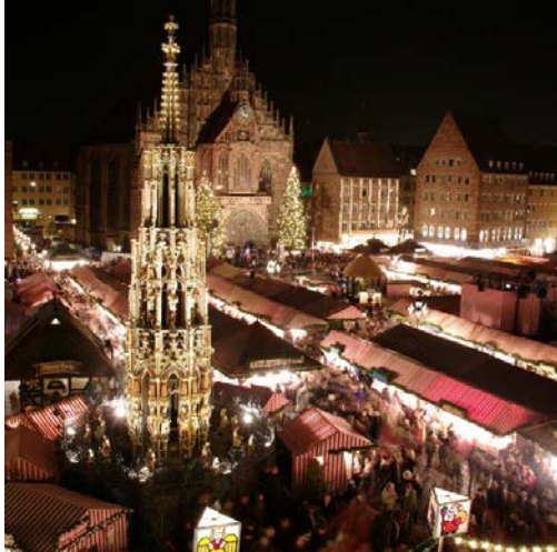
Christkindlesmarkt Nürnberg

After that just walk downhill to Nuremberg's sprawling Christkindlesmarkt.